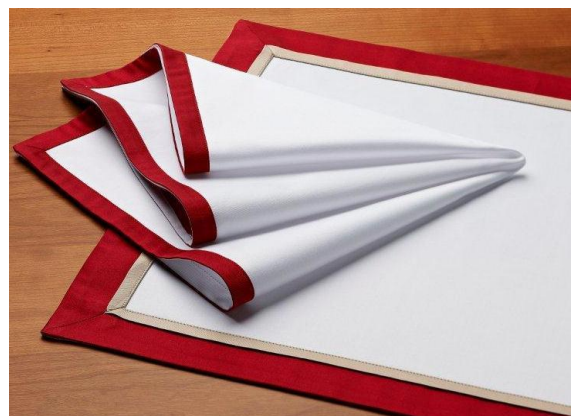
"Double Border" - Available on pure Egyptian cotton or pure linen. Double border is available in a wide range of colours. It can be used on all table linen as a contrasting feature.