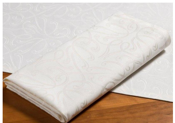
"Milano" - cotton and linen mix, available in cream.