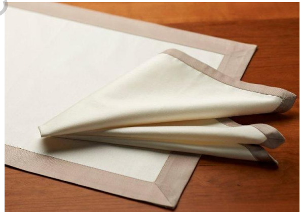
"Contrast Border" - Available on pure Egyptian cotton or pure linen. Contrast border is available in a wide range of colours, piping or embroidery can also be added to this design for extra detail.