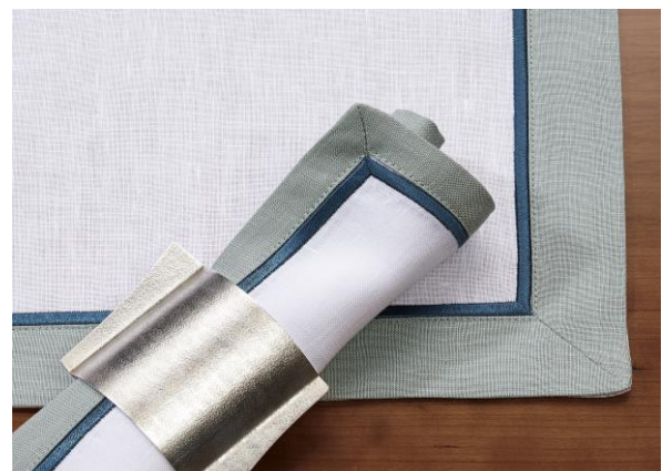
"1 Row Antibes" 100% Provenza Linen white with Irish Winter border, Blue 1161 embroidery