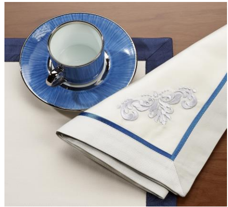
Centre: "Sorrento Border" Satin 301 with Sorrento Navy 307 jacquard Border Right: "Flower Lace" Satin 201 with Silver 204 3cm Border, piped Blue 9843. Silver 1011 embroidery