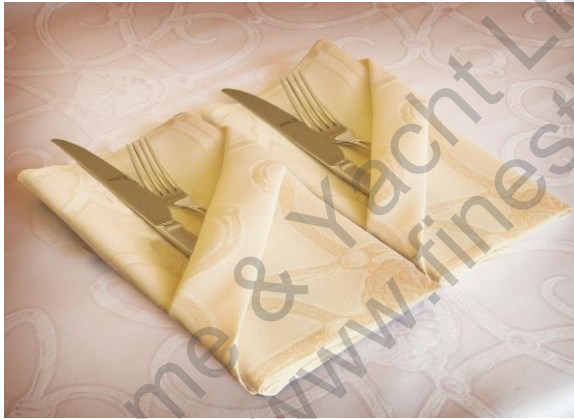
"Elegance" Cotton and Linen Mix Napkins, Tablecloth's or Placemats standard colours in White, Silver 173, Cream 301, Gold 466. Other colours available on request.