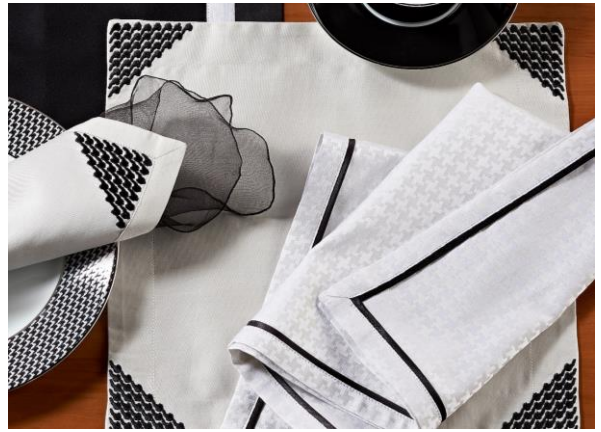
"Houndstooth" taken from a jacquard design, this is a bespoke embroidery, designed to match the crockery. Available on pure Egyptian cotton or pure Linen. Embroidery available in a wide range of colours.