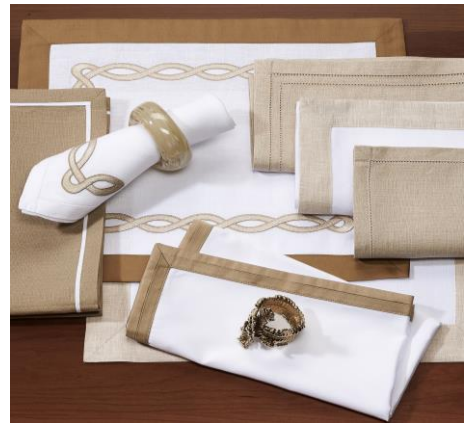
Centre: "Rope" 100% Provenza White with Nocciolina Border, 1060 Beige/1128 Taupe embroidery, Placemat with Matching Napkin Right: Various 100% Provenza styles in 1/2 Bolitto, White and Bolitto Left: "Classic Cord" 100% Provenza Linen Wafer 882297, White cotton piping Bottom: "Double Border" Satin White, with wafer 882297 double border