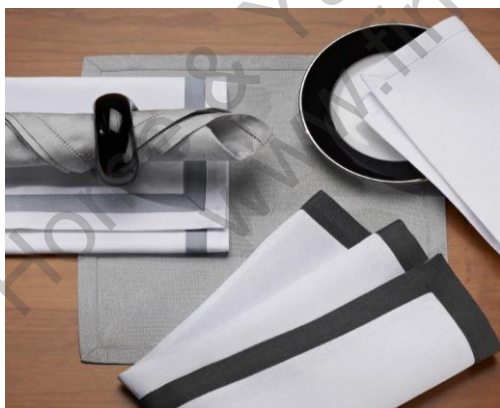
Centre: "Elegance" in Cotton and Linen Mix, Napkin, Silver 173 Left: "Inset Border" Classic Plain Napkin, White and Blue/Grey 458 Left: "Flora" Cotton Satin Jacquard with Hemstitching, Napkin, Silver 173 Top Right: "Monaco" Cotton Diamond Pique White, Napkin. Bottom: "Contrast Border" in Provenza White with Grey 891277 border