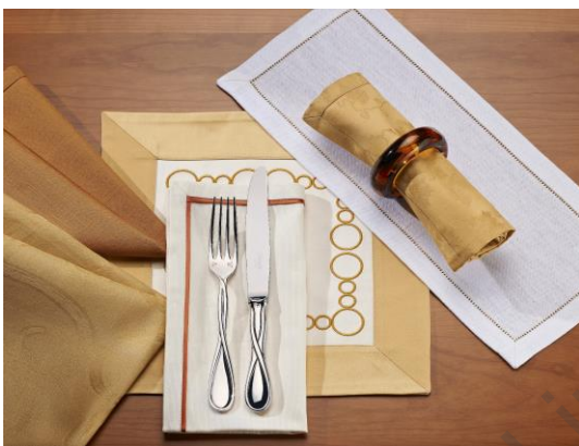
Centre: "Solar" Pesante Placemat, Cream 301 centre and Gold 466 Borders Left Top: "Loira" Gold sovero 721817, Napkin Left Bottom: "Elegance" Cotton and Linen Mix, Napkin, Gold 466 Top Right: "Canapone" White Placemat, Hemstitched in gold Left Top Right: "Barolo" Cotton Satin Jacquard, Napkin, Gold 466 Left Bottom Centre: "Classic Cord" Panama Napkin, Avorio with piping in Orange 9881