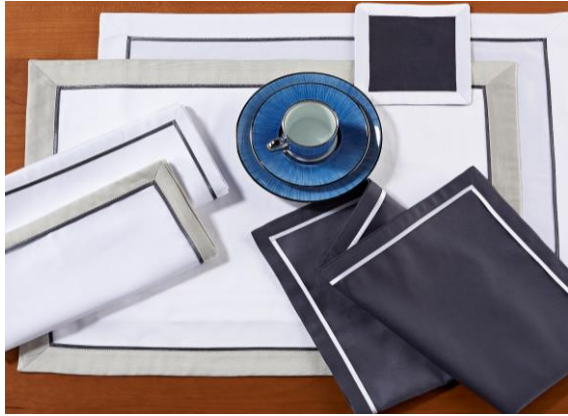
"Classic Cord" - Available on pure Egyptian cotton satin or pure linen. Classic cord is a piping detail available in a wide range of colours. It can be used on all table linen for a contrasting or subtle feature.