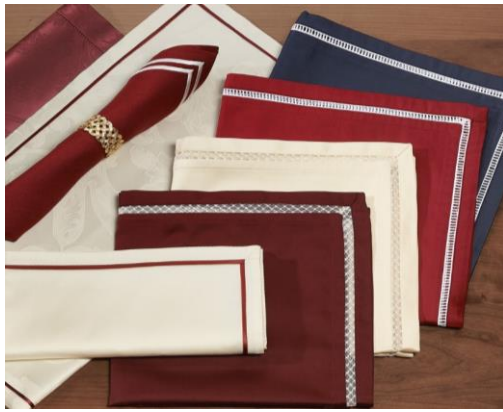
Top Left: "Flora" Satin Jacquard, Hemstitched, Napkin, Red 348 Left: "Florestine" Satin Jacquard, Ivory with Red 98612 piping Left: "2 Row Antibes" 100% Provenza Linen in Valenza, Napkin, Right Back: "Ladder Lace" Satin Navy 307 and Red 288, Napkins.