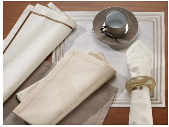
Centre: "3 row Cord" 875 Irish Linen Placemat, Natural Linen, with embroidery in Beige 1060 Top Left: "Classic Cord" Panama Napkin, Avorio with piping in Bronze 932 Bottom Left: "Provenza" Lino Bollito with Hemstitching, Napkin Bottom Left: "Grace" Cotton and Linen Mix Jacquard Napkin - available only in white Bottom Right: "Milano" Cotton Satin Jacquard, Napkin, Cream