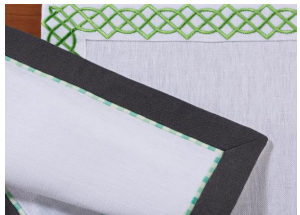
Canapone - pure linen. This is a heavyweight linen fabric available in a range of colours. Available in most finishing styles, not available to be hemstitched.