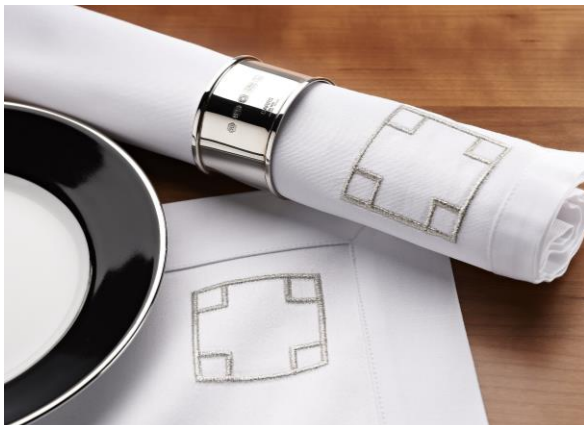
"Baltic" - available on pure Egyptian cotton or pure linen. Embroidery available in a wide range of colours, including lurex thread (as shown)