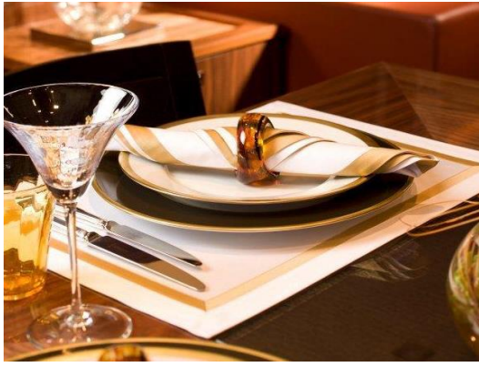
"Inset Border" Pesante Placemat with inset border with matching napkin with contrast border both in Gold 210