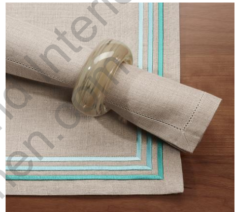
"3 Row Antibes" 100% Provenza Linen, Bollitto, embroidery in 1246 Teal, 1088 Mint Green and 1292 Aqua