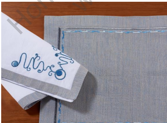
Normandia - pure linen. Available in a range of colours this fabric has a unique colour finish to it. Available in all finishing styles.