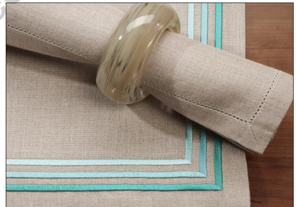
"3 Row Embroidery" - Available on pure Egyptian cotton or pure linen. Available in a wide range of colours