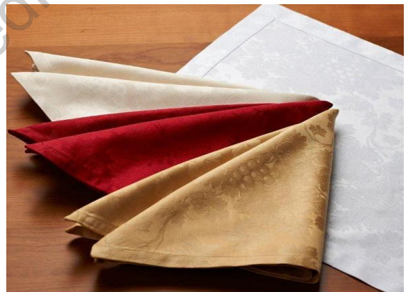
"Barolo" Jacquard woven Cotton Satin, available in White, Green, Silver, Cream, Gold, Red, Burgundy, Navy