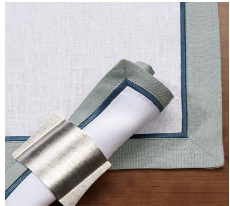
"1 Row Antibes" 100% Provenza Linen white with Irish Winter border, Blue 1161 embroidery