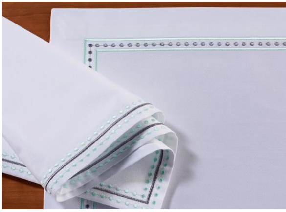
"Zenith" - available on pure Egyptian cotton or pure linen. Embroidery available in a wide range of colours