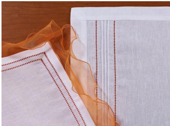
"Hemstitch" - Available on pure Egyptian cotton satin or pure linen. Available in self colour or with a contrasting colour.