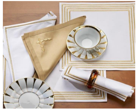
Centre: "Athens" Pesante Placemat, White with Gold 4 Lurex embroidery Top Right: "Athens" Pesante Placemat, White, Gold 4 Lurex embroidery Top Left "Majestic" Classic Plain Napkin, White, Gold 2/4 Lurex embroidery Top Centre: "Sirius" Classic Plain Napkin in Gold 210, Gold 1070 embroidery Bottom Right: "Majestic" Pesante Placemat, White, Gold 2/4 Lurex embroidery