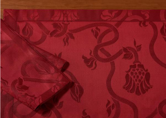
"Tiffany" jacquard cotton satin, available in a range of colours.