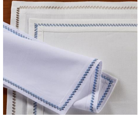
A close up example of a bespoke embroidery design on table linen. Available on cotton satin or pure linen