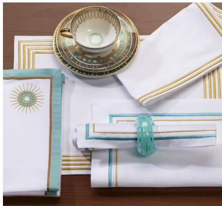
Centre: "Athens" Pesante Placemat, White with Gold 4 Lurex embroidery Right: "Athens" Pesante Napkin, White with Gold 4 Lurex embroidery Left: "Sirius" Satin White, Atollo 767547 Border, 932 piping, embroidery in 1088 Mint/Gold Lurex Bottom Right: "Vela" 100% Provenza Linen, embroidery in 1088 Mint/Gold Lurex