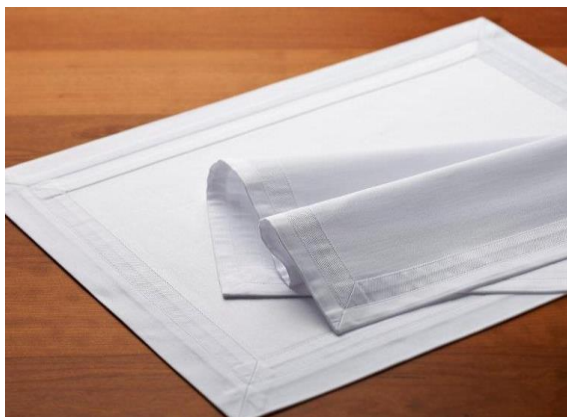
"Inset border" - Available in pure Egyptian cotton or pure linen. Inset border is available in a wide range of colours, or in self colour as shown for a more subtle finish.