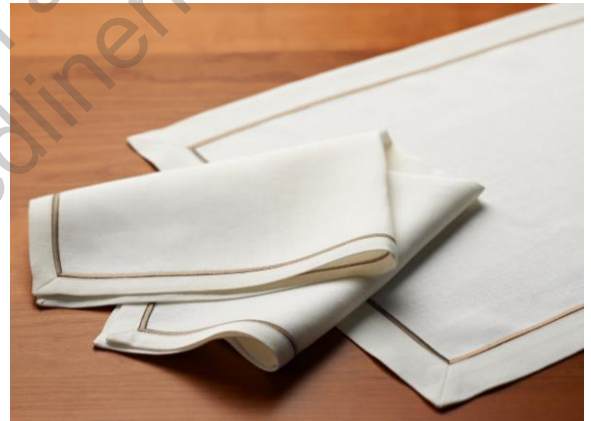
Pure Irish linen - available in weight 875 and 975. Shown with 1 row of embroidery in Brown, available in other finishing styles.