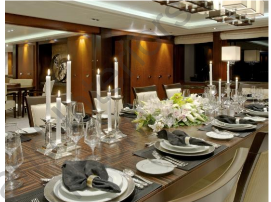
Superyacht - table linen for dining area

Home & Yacht Linen www.finestbedlinen.com