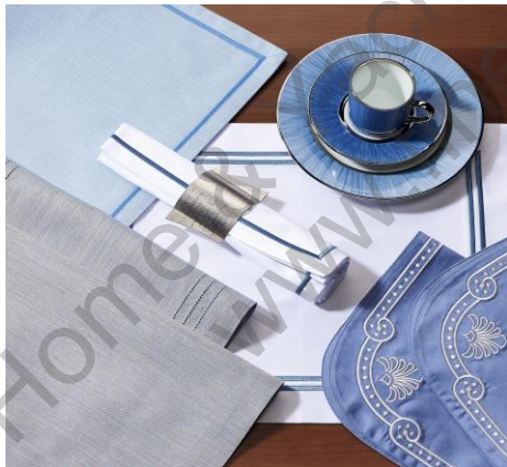
Top Left: "Classic Cord" Loira Speronella, 163 Cotton piping Centre: "2 row Antibes" Satin White, 1353 Blue Embroidery, Placemat Centre: "1 row Antibes" Satin White, 1353 Blue Embroidery, Napkin Left: "3 row Hemstitch" 100% Normandia Linen, Ossidiana 491253 Left: "Carmen" Satin Blue 358, silver 1287 Carmen embroidery