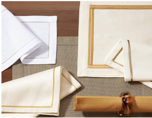
Centre: "Double Border" Pesante Placemat, Gold 210 and Terracotta 325 Left: "Contrast Border Piped" Classic Plain, Napkin, White and Border in Gold 210, with Terracotta 325 piping Top Left: "Classic Cord" Classic Plain Napkin, piped in Orange 9881 Bottom Right: "Double Border" Pesante Placemat, Terracotta 325 and Gold 210