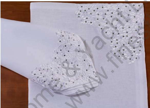
"Petal" - available on pure Egyptian cotton or pure linen. Embroidery available in a wide range of colours, available without crystals