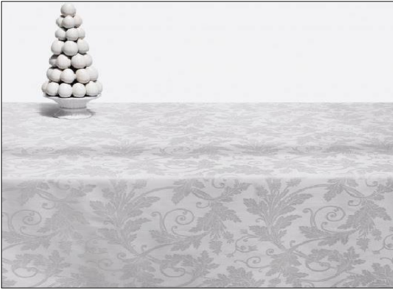
"Flora" available in White, Green, Silver, Cream, Burgundy, Dark Green, Navy and Gold