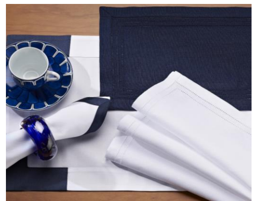
Centre: "Contrast Corner" Classic Plain Placemat, White and Navy 307 Left: "Contrast Border" Classic Plain Napkin White and Navy 307 Top Right: "3 Row Hemstitch" in Provenza Blunavy 861717, Placemat Bottom Right: "2 Row Hemstitch" Provenza White, Napkin.