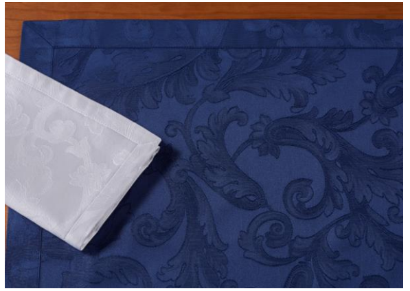
"Florestine" jacquard cotton satin, available in a range of colours.