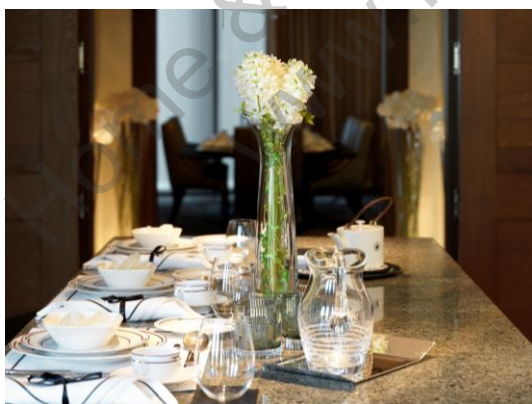
One Hyde Park Kitchen - "Cannes" Placemat and Napkin piped in Grey 9856 Available in White, Brown, Navy and Cream