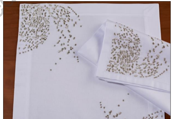
"Stardust" - available on pure Egyptian cotton or pure linen. Embroidery available in a wide range of colours.