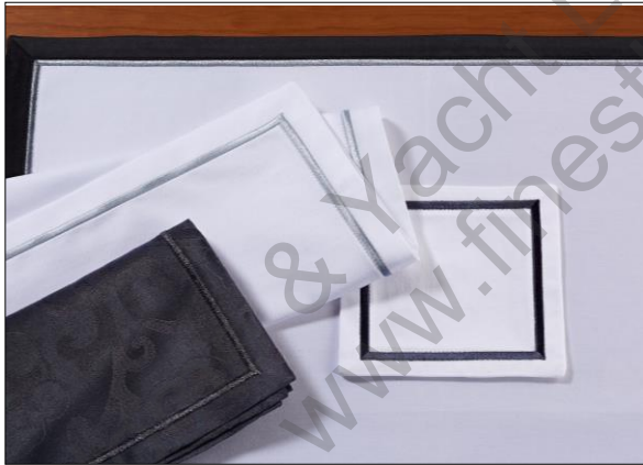
"1 Row Embroidery on the border" - available on pure Egyptian cotton or pure linen. This one row embroidery is available on the border in a wide range of colours, also available with contrasting or self colour border.