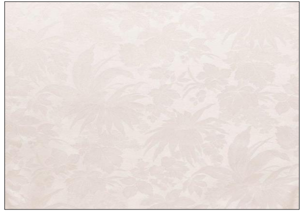
"Classic Alice" available in White or Cream 301