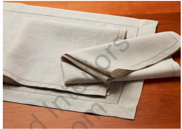
Provenza - pure linen. Available in a wide range of colours and finishing styles.