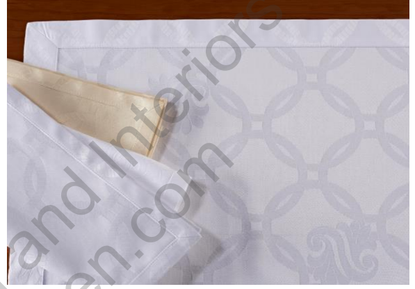
"Harmony" jacquard cotton satin, available in a range of colours.