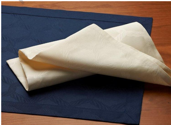
"Sorrento" Napkin and Placemat available in either Cream or Navy