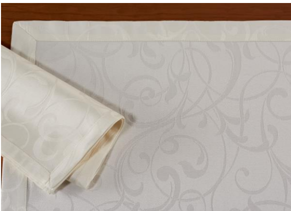
"Giselle" jacquard cotton satin, available in a range of colours.