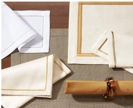
Centre: "Canapone" 100% Heavyweight Linen, Placemat, Wafer 882297 Top Left: "Canapone" 100% Heavyweight Linen, White with Gold Hemstitch Top Right: "3 Row Piping" Satin 301, with Sovero and Caramel Piping Right: "Classic Cord" 100% Panama Cotton, Ivory, 932 piping Left: "Classic Cord" Pesante Satin 301, 9063 piping