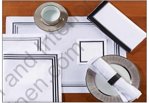
"Antibes" - Available on pure Egyptian cotton satin or pure linen. Antibes is an embroidery available in 1 row, 2 row or 3 row in a wide range of colours. It can be used on all table linen for a decorative feature.