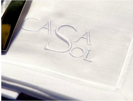
Private Villa - exterior table linen, with logo and piping