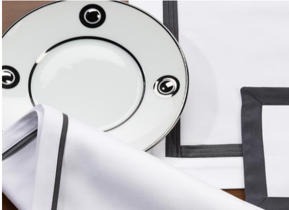
Pesante - pure Egyptian cotton satin. Available in a wide range of colours and finishing styles.