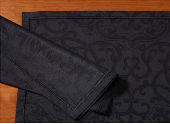
"Zaira" Jacquard Cotton Satin, available in a range of colours, with or without embroidery.