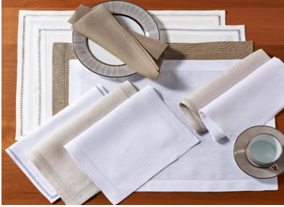
"Bespoke embroidery" - we now offer a new range of small embroidery designs, that offer a subtle finish on placemats and napkins. The embroidery is available in self colour or in a wide range of contrasting colours