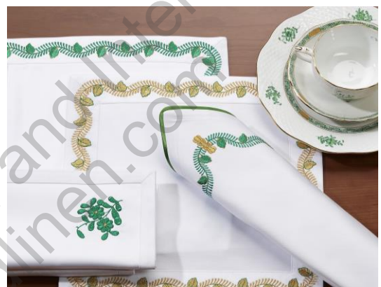
Back Right: "Appoyni Leaf" Satin White, 1079 Green Embroidery Centre: "Appoyni Leaf" Satin White, Gold Lurex/1079 Green Embroidery Centre Right: "Appoyni Leaf" Satin White, 1079 Green/Gold Lurex Embroidery, piped green 98615 Left: "Appoyni Flower" Satin White, 1079 Green Embroidery