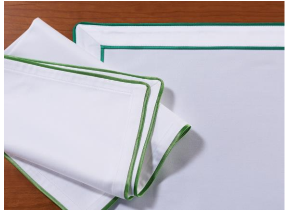
"Double piped or single piped on outer edge" - a variation on the Classic cord finishing style. Available in a wide range of colours.