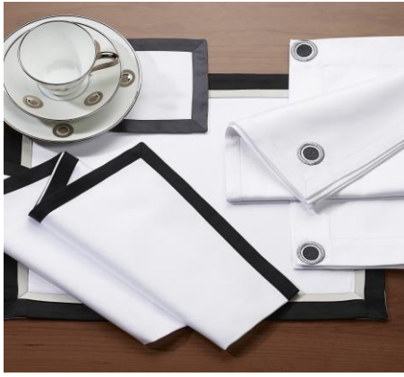
Top: "Contrast Border" Satin White with 1cm Grey 476 Border Left: "Contrast Border" Satin White with 1.5cm Black Border Centre: "Double Border" Satin White with 3cm Black Border, 1cm Silver 204 Double Border Right: "Eclipse" Satin White with 4044 Titanium/4070 Carbon Metallic embroidery