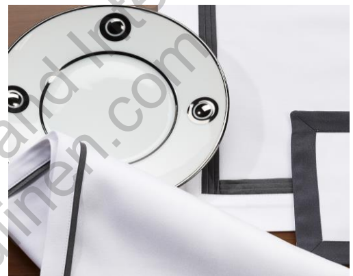
Front Right: "Contrast Border" Satin White with 1cm Grey 476 Border Back: "3 Row Piping" Satin White with Grisaglia 791277 piping Front: "Classic Cord" Satin White with Grisaglia 791277 piping