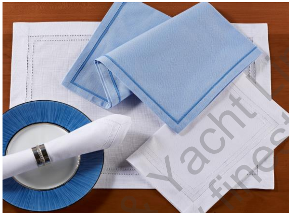
Loira - pure linen. Available in a wide range of colours and finishing styles.