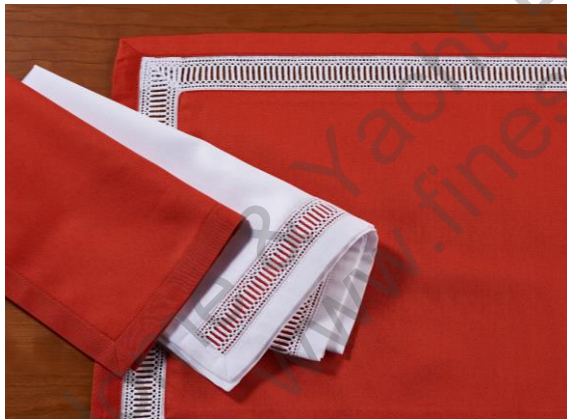
"Lace Inset" - Available on pure Egyptian cotton satin or pure linen. We now offer a wide range of laces available as an insert or an inset with a self colour or contrasting border underneath. All laces available in white and cream.