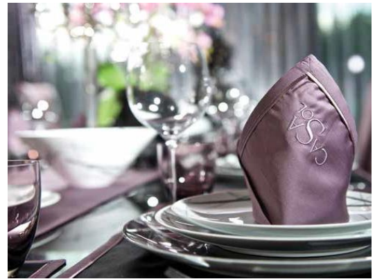
Private Villa - table linen on cotton satin with logo and piping