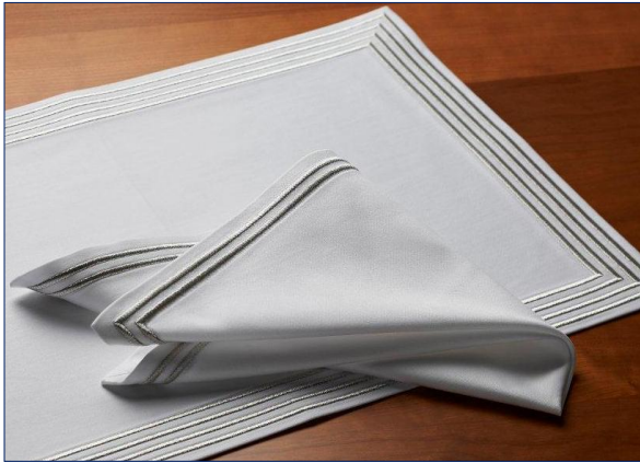
"Athens" - available on pure Egyptian cotton or pure linen. Embroidery is in Lurex threads on the border, available in 2 Row and 4 Row.