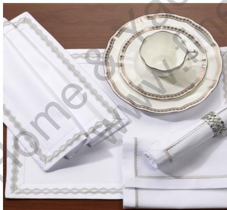
Centre and Left: "Carlton Mosaic" Satin White with Silver 1085 embroidery Bottom Right: "Scalloped 1 Row" Satin White with Silver 1085 embroidery