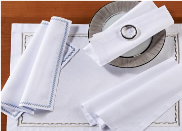
"Cannes" - pure Egyptian cotton pique. Available as an inset border or as a base fabric. Featured here with bespoke embroidery to match crockery.