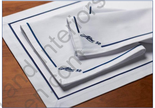
"Personalised Antibes" - available on pure Egyptian cotton or pure linen. 1 row embroidery with logo or name featured in the corner for personalised detail.