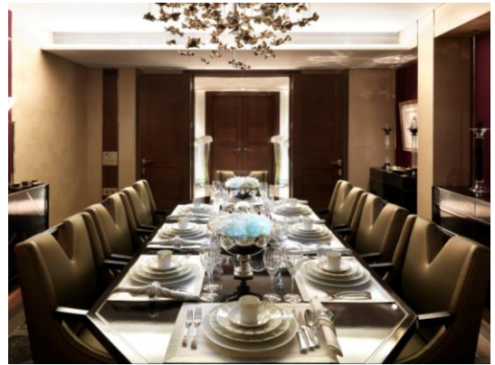
One Hyde Park Dining Room - "Contrast Border" Pesante Placemat with 3cm Border in Silver with matching napkin with 1.5cm contrast border in Silver