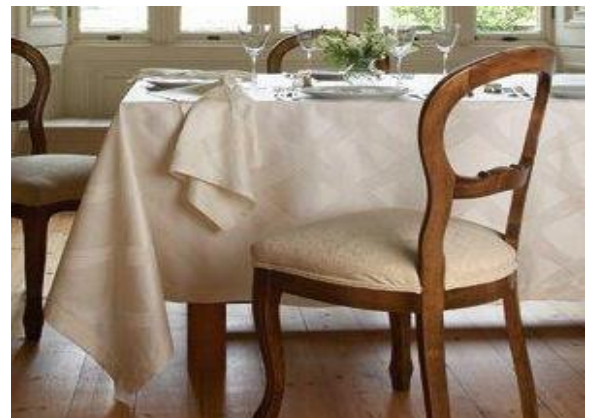
"Grace" Available in White ONLY